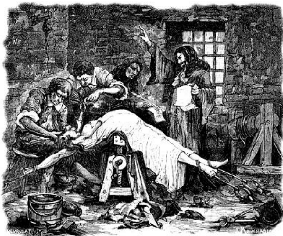
Above: King Morgan Hanstet and his followers torturing an Elf woman by forcing boiling oil down her throat.

It has been seven years since the destruction of the Great City of Netherlye and the appearance of the rifts where the three towers dedicated to the arts of Magik once stood. In this time Morgan Hanstet, former king of Netherlye who was once believed to have been killed in the explosion, has rallied his forces to the extent that they have secured the Redveil Mountains in the north. This vile human being continues to draw bandits, mercenaries and other malicious humans to his cause, and they have now officially waged war against the L'Enarousse and the non-human races of Neothera.